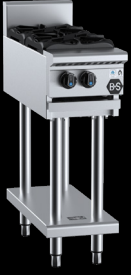
BT-SB2 —Two Burner Boiling Top On Stand