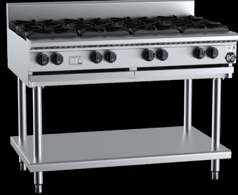
BT-SB8 —Eight Burner Boiling Top On Stand