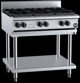
BT-SB6 —Six Burner Boiling Top On Stand