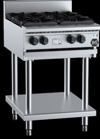
BT-SB4 —Four Burner Boiling Top On Stand