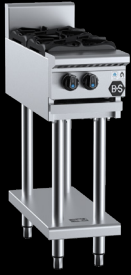
BT-SB2 —Two Burner Boiling Top On Stand