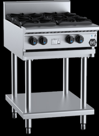
BT-SB4 —Four Burner Boiling Top On Stand